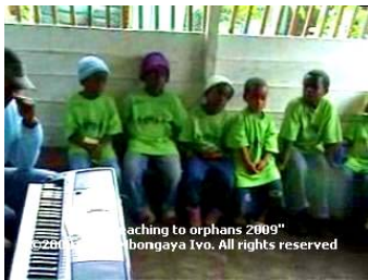
"Outreaching to orphans 2009"

Left: Musicians poised to entertain the children. Their collaboration added flare and warmth to the occasion. It is also the first time Fako-based artists are mobilised by an organization to play for vulnerable orphans.