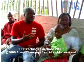
"Outreaching to orphans 2009"

Far Left: The banner of "Outreaching to orphans 2009" hangs below the sign post of the orphanage.