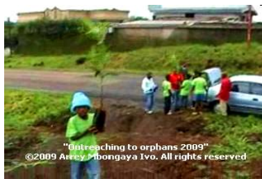
"Outreaching to orphans 2009"

Far Left: Cheerful orphans at their reception hall.