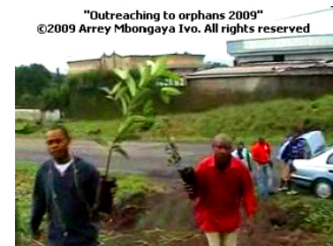
"Outreaching to orphans 2009"

Far Left: The children Enroute to greening Save the Children Alliance's new site.