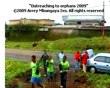
"Outreaching to orphans 2009"

Far Left: The Matron Enroute to greening Save the Children Alliance.