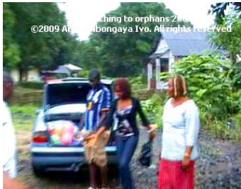
"Outreaching to orphans 2009"