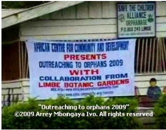
"Outreaching to orphans 2009"