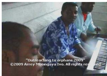
"Outreaching to orphans 2009"